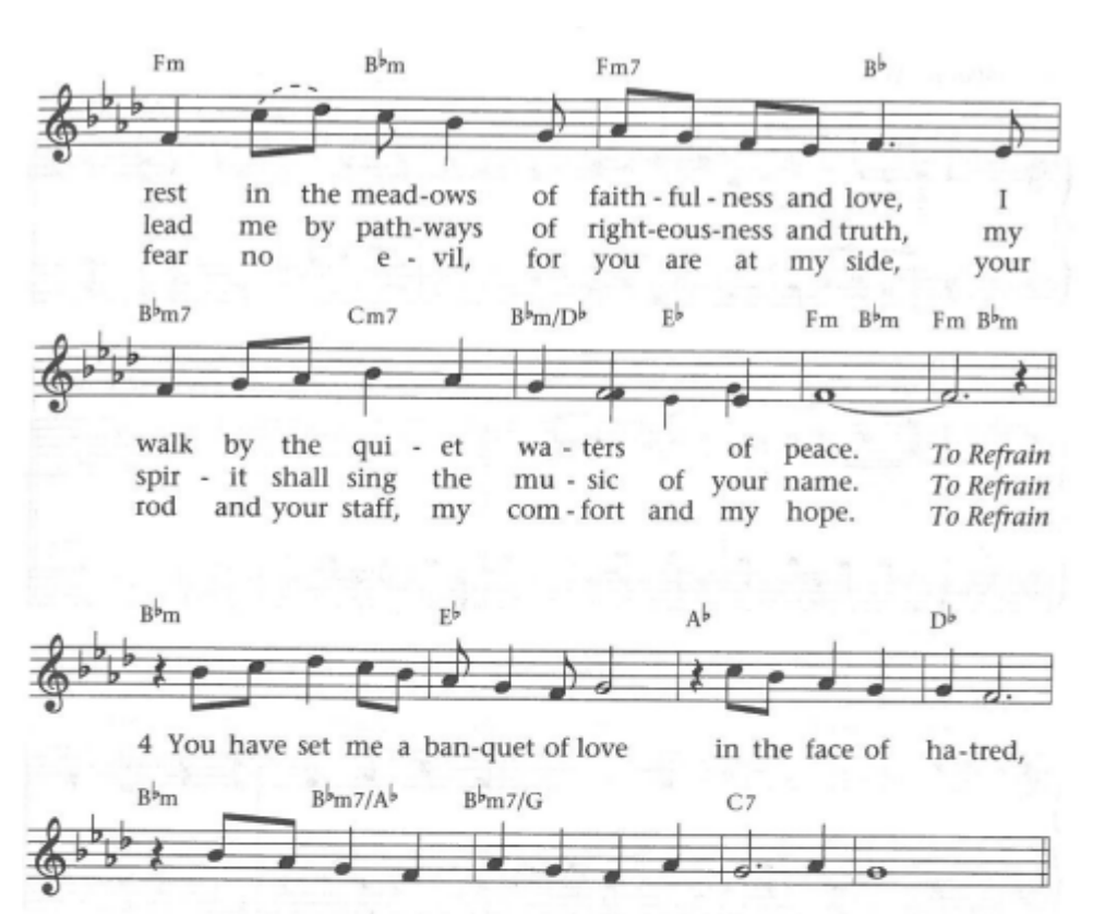
crown-ing me with love be-yond my power to hold. To Refrain