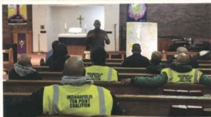
INDY TENPOINT COALITION

Faith Presbyterian Church uses their share of the Peace & Global Witness Offering to support Indy TenPoint, a not for profit organization in their community that works with young people to reduce gun violence, stabilize neighborhoods and build better lives.