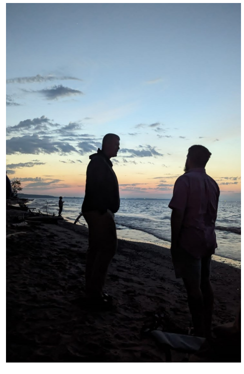
229 North 28th Street East Superior, WI 54880

Office: 715-392-4751 Pastor: 717-247-4433